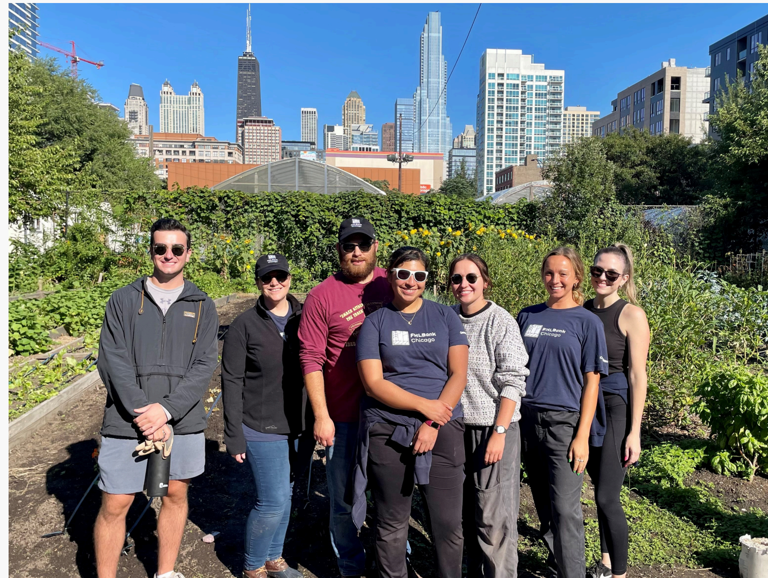
FHLBank Chicago Sustainability Engagement Team Volunteer Event, Fall 2023