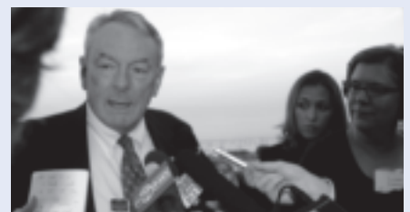
International Olympic Committee member Richard Pound is interviewed by reporters attending DePaul's symposium.